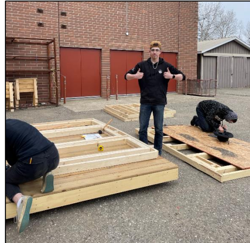
TRSS woodworking students are building playhouses to raffle off when they are completed.