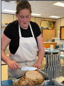
Students and staff at TRSS enjoyed a turkey dinner that was prepared by students, staff and volunteers.

At Canalta Elementary, Mrs. Hiebert's grade 3-4 class designed a thematic day where they took a trip to Disneyland. They boarded a plane (made from cardboard) outside of the classroom and flew to Disneyland (classroom). While there, the students participated in many of activities throughout the day linked to Disneyland. The students really enjoyed their trip to Disneyland!