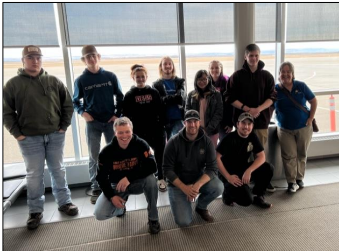
Good luck to all the students that are heading off to the BC Skills Canada provincial competitions in Abbotsford. Students will be competing in provincial junior and senior skills competitions on April 19, 2023.