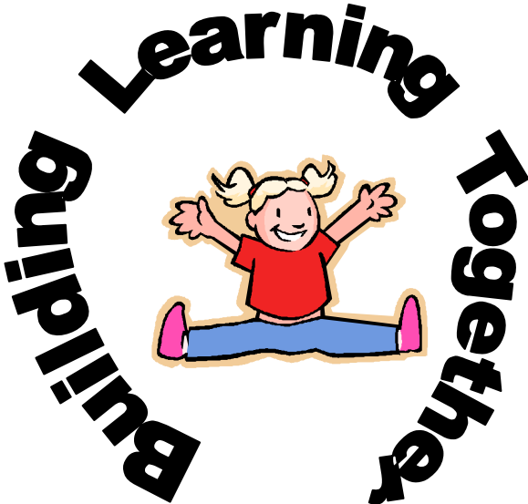
South Peace Building Learning Together Society